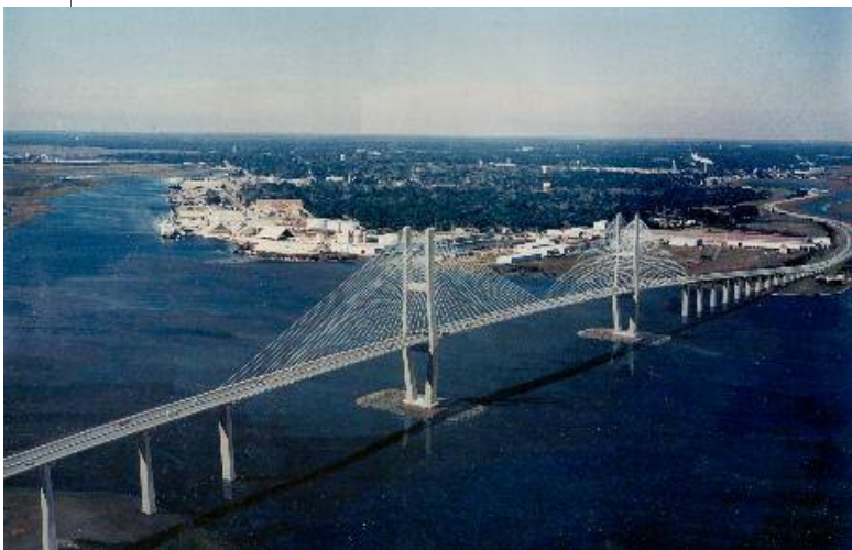
The Sidney Lanier Bridge in Brunswick. The largest suspension bridge in the state.