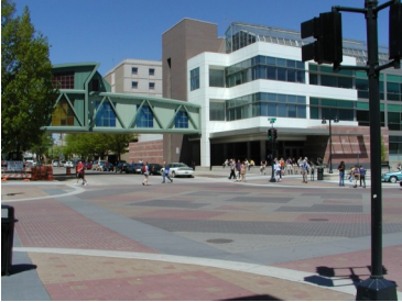
University of Iowa