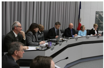
Mayor and City Council