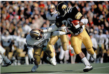
Big Ten Football