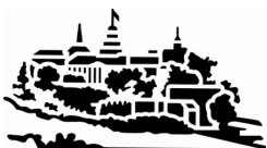
CITY OF IOWA CITY

scattered woodlands, and tall grasses. In the Iowa City area alone, there are 41 public parks, several of which overlook the scenic Iowa River. Many of these parks are equipped with networks of walking and biking trails as well as picnic sites and prairie reserves. In 2009, Iowa City was designated a Bicycle Friendly Community (Bronze Level) by the American League of Bicyclists.