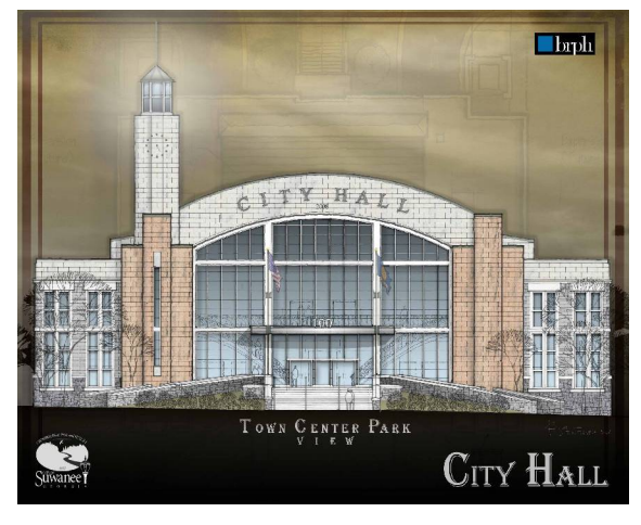
Architect Drawing of the New City Hall

Like many Gwinnett County communities, Suwanee began as a small agricultural town with strong ties to the railroad. Today, the City works hard to retain its charm and sense of neighborliness and to manage growth in smart, innovative ways. Suwanee is committed to revitalizing its historic area while creating the new commercial Town Center, providing outstanding services to citizens and businesses, revitalizing the I-85/Suwanee Gateway area, and fostering a true sense of community.