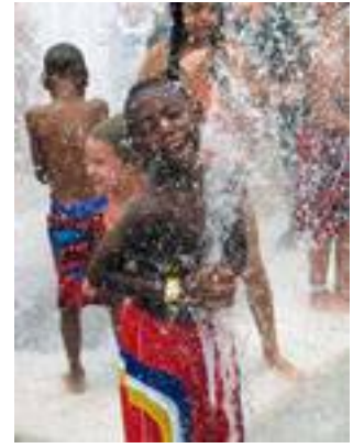
Children play at Town Center Park