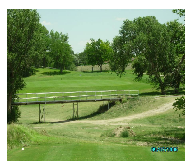
City owned Golf Course