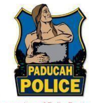
"Community and Police Partnership"

Paducah's historic homes and museums, art galleries, theater productions, festivals, and concerts generate more than 800,000 hotel participant-