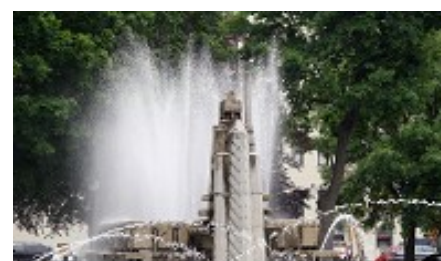
Bronson Park Fountain in Kalamazoo