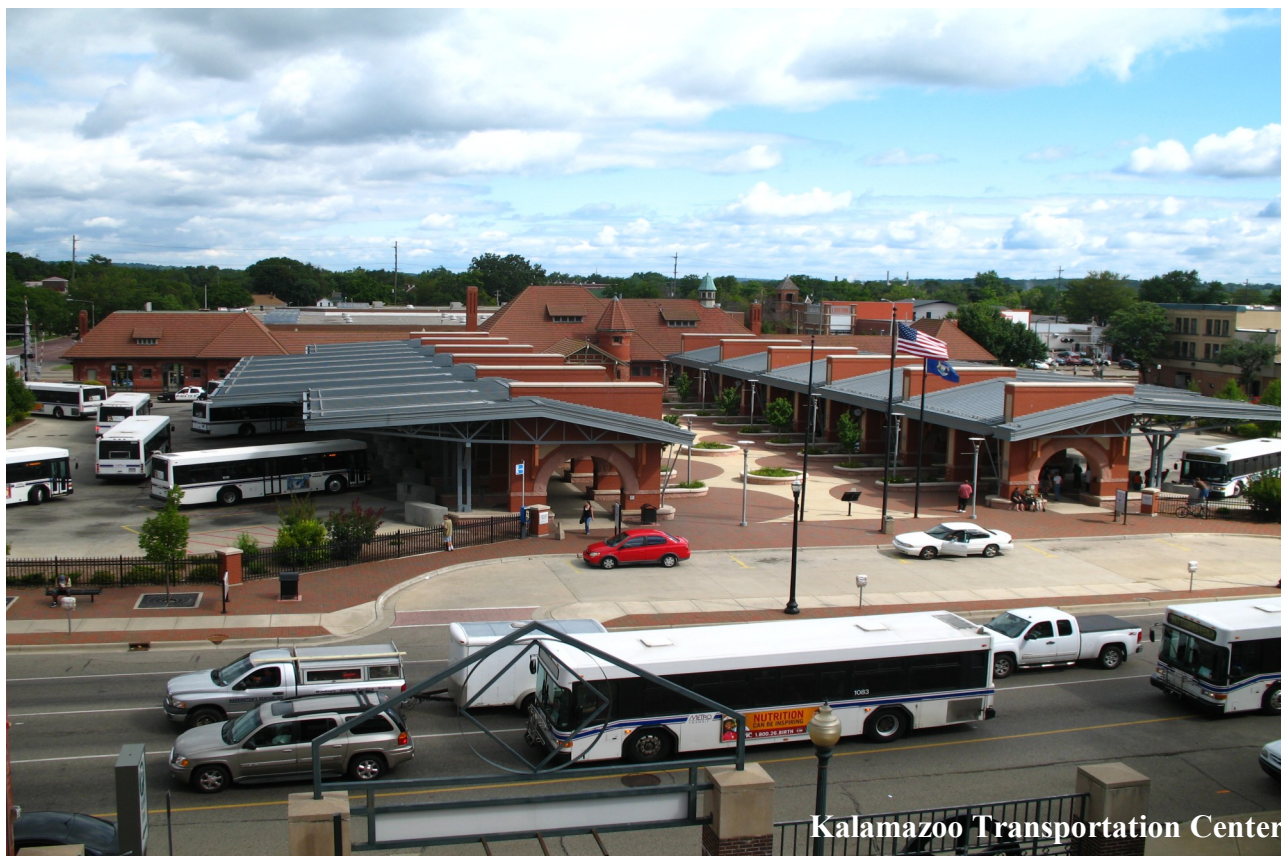
Kalamazoo Transportation Center