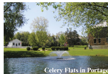
Celery Flats in Portage