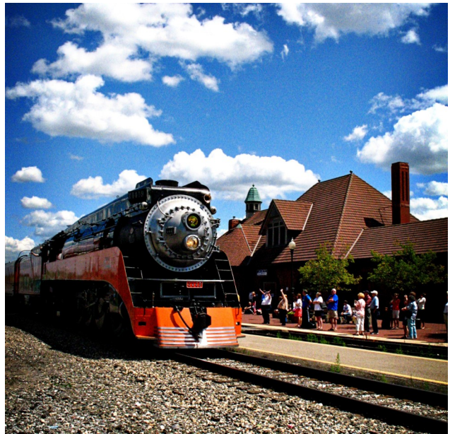
Historic Train Station in Kalamazoo

In 2010 a clear path was established for the transfer of the public transportation system to the KCTA by 2013.