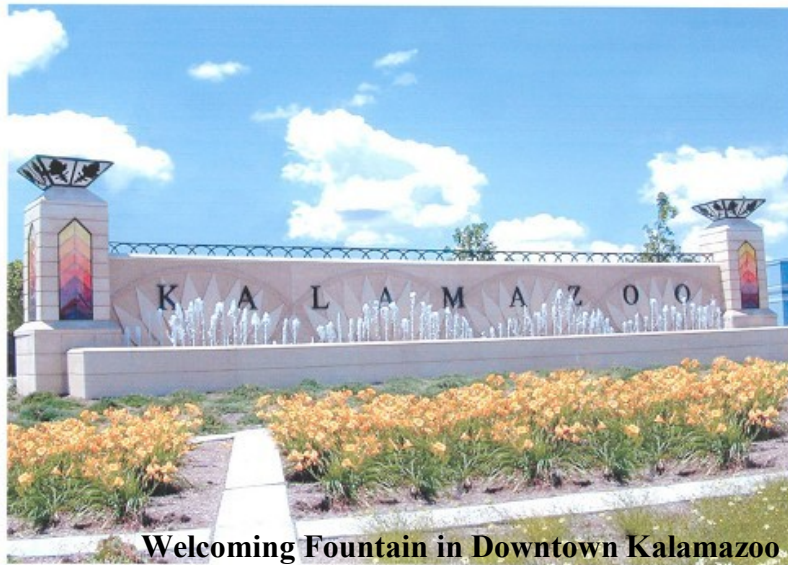
Welcoming Fountain in Downtown Kalamazoo