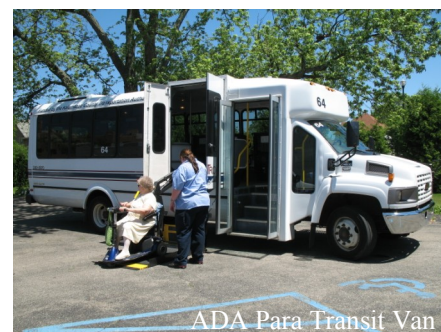
ADA Para Transit Van