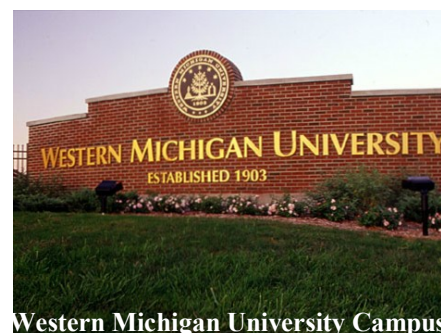
Western Michigan University Campus